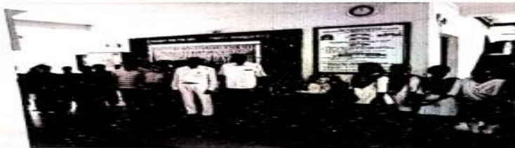
Principal Mazara College