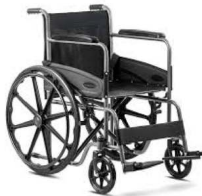
Wheel chair availability

Way to Classrooms, administration office, Botany and Zoology Laboratory