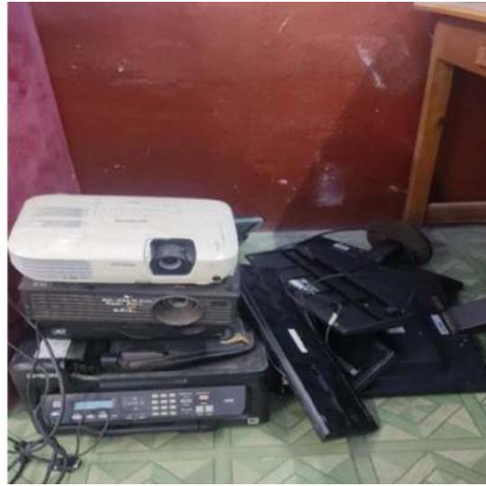
Solid Waste E-waste Storage